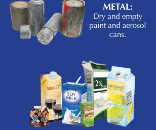
CARTON CONTAINERS: (placed in a sealed Aseptic cartons, including milk cartons lear plastic bag for and juice boxes, half-gallon juice cartons, soup/broth cartons, and wine cartons.

plates, egg cartons, block packaging (no peanuts), rigid polystyrene, and carry-out containers